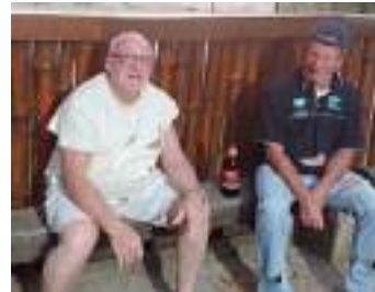
Another two skollies