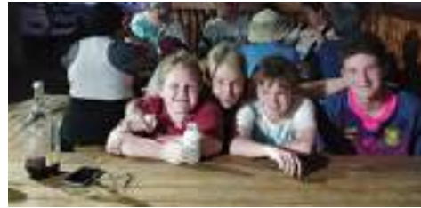
Gang found with a demi OB's