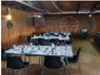
Before the hobos hit the joint