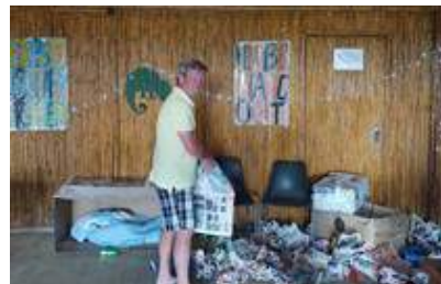
Caught in the act of trashing the joint