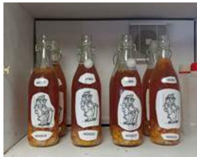
Halket Hobo Hooch