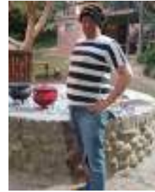
Soek nie kak met die Kok nie