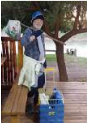
Hobo found on river bank