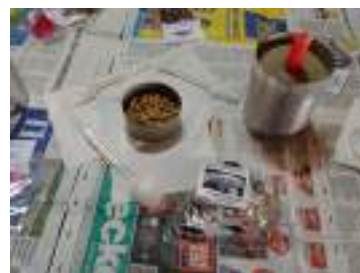
Table clothes had to stand the test of time