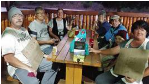
Homeless Trio and other assorted characters